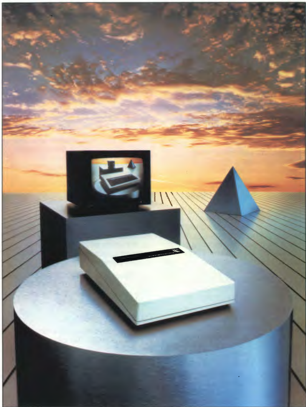
The British Broadcasting Corporation Microcomputer 6502 Second Processor