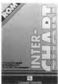
Chart & Graph Plotting

Existing owners may obtain a 20% discount, or a trade-in for £10.00 + VAT